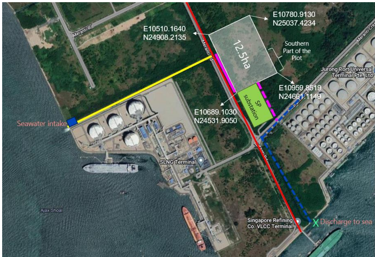
Figure 2: Location of EMA's Identified Greenfield Site