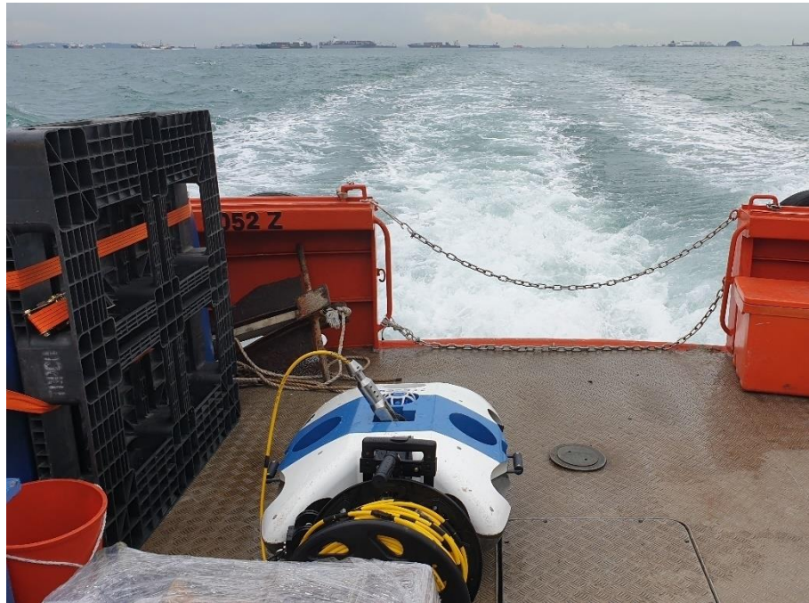
Caption: Close-up view of BeeX Pte Ltd's existing Hovering Autonomous Underwater Vehicle (HAUV)