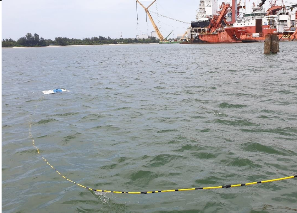
Caption: Existing Hovering Autonomous Underwater Vehicle (HAUV) being deployed to remotely inspect or monitor underwater infrastructure Video Link: https://www.youtube.com/watch?v=yq0GvQSSeBE