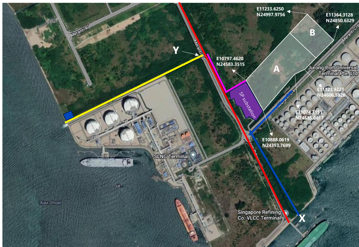
Figure 2: Location of EMA's Identified Greenfield Site

1. RFP Winner taking up the greenfield site shown in Figure 2 shall take note of the following: